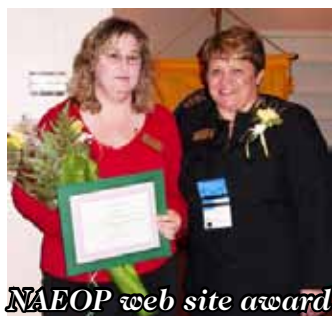
NAEOP web site award