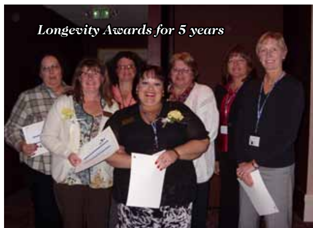
Longevity Awards for 5 years