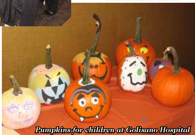
Pumpkins for children at Golisano Hospital