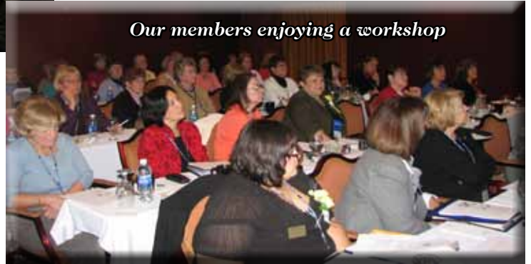
Our members enjoying a workshop