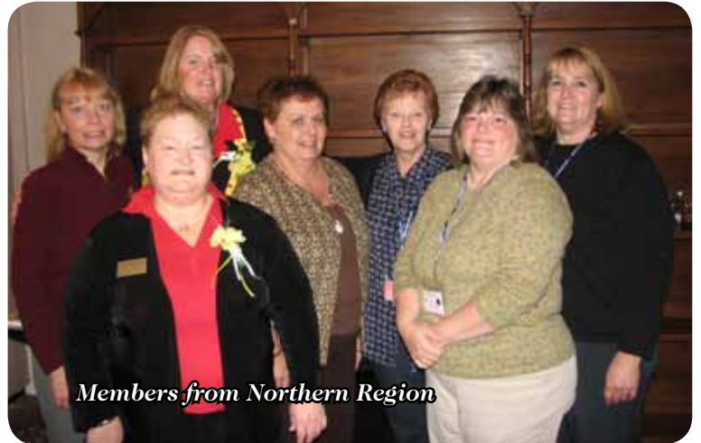
Members from Northern Region