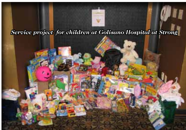
Service project for children at Golisano Hospital at Strong