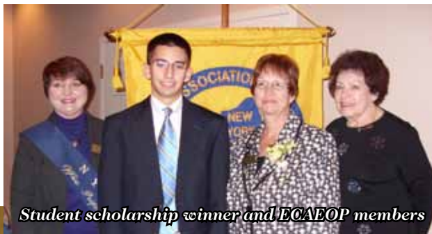
Student scholarship winner and ECAEOP members