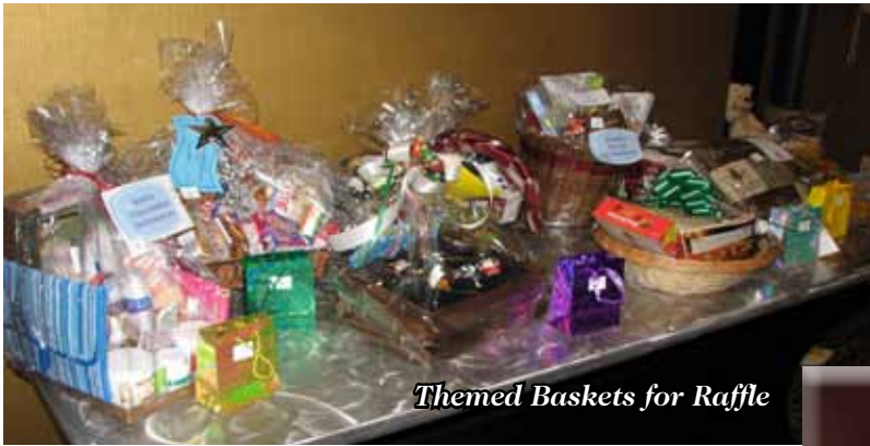
Themed Baskets for Raffle