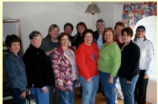
2009-2010 Board Members

In closing, we would love to have you come visit Oregon, and join us on April 17 th . Hope to see you then!