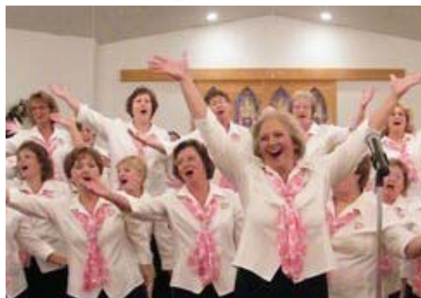
Heart of Columbia Chorus