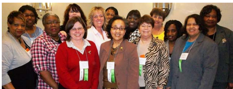
2011 SCAEOP Conference in Myrtle Beach