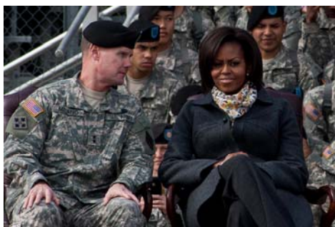
First Lady Michelle Obama and Fort Jackson Soldiers

One of our very own RAECOP members was rubbing shoulders with the “big shots” as January 2011 came to an end. First Lady Michelle Obama was the guest speaker for the Basic Training Graduation at Fort Jackson in Columbia, South Carolina on January 27.