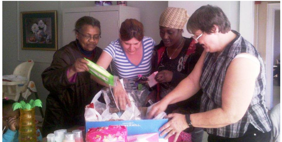
Hannah House Residents Enjoying the Valentine's Day Basket