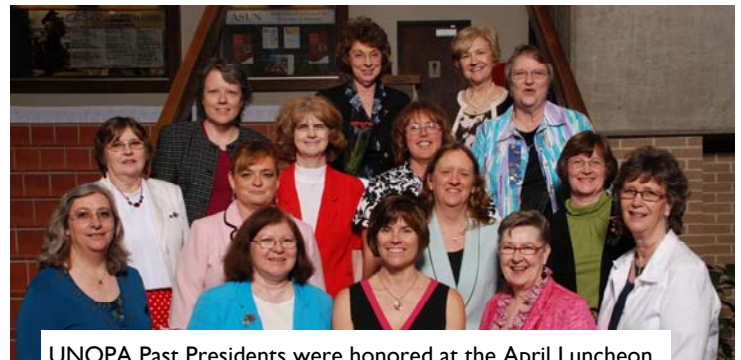
UNOPA Past Presidents were honored at the April Luncheon

It's hard to believe that by the time you will be reading this, it will be May! My term is rapidly coming to a close.