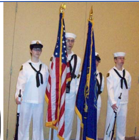
The Navy Sea Cadets, Lincoln Squadron did the opening Flag Ceremony