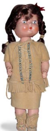
Emma Empire NYSAEOP Mascot

My goal as NYSAEOP's President is simple... to recruit and retain members. With that in mind, I will need your support in promoting NYSAEOP. Will you help spread the good word about your Association? Will you help keep the lines of communication open between our members and the NYSAEOP Executive Board? I'm sure I can count on you to do your share and I promise I will do mine.