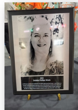
Plaque to be mounted at La Porte High School