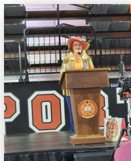
Acceptance Speech (she was surprised!)